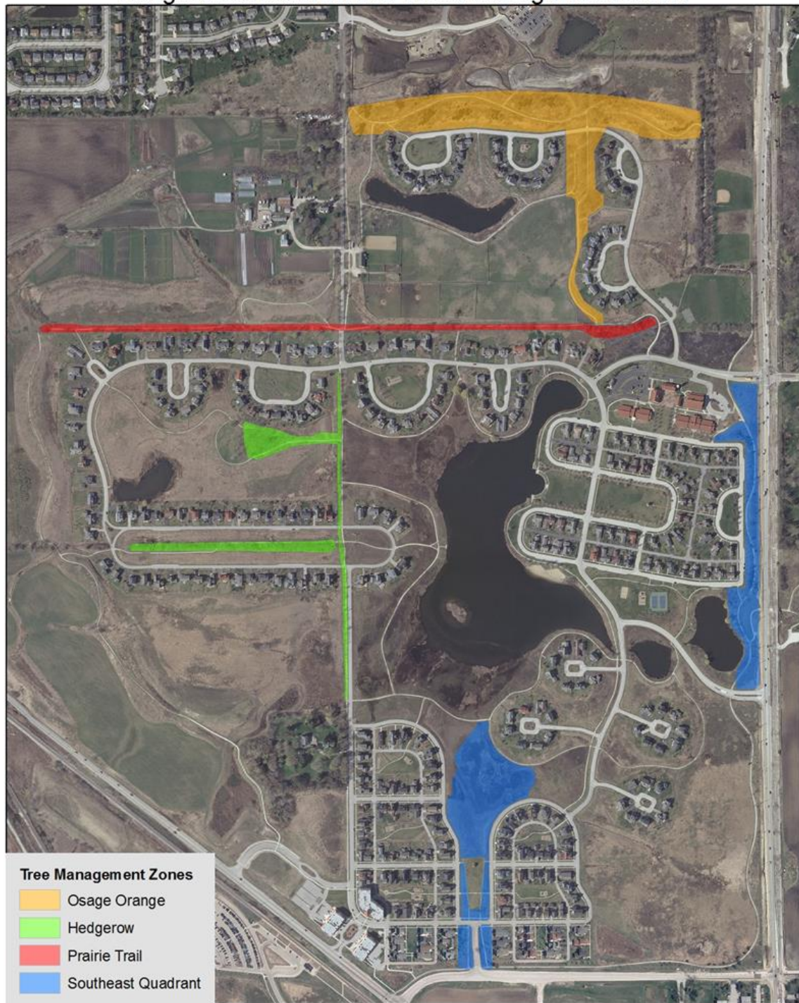
Hedgerow & Natural Area Trees Management Zones